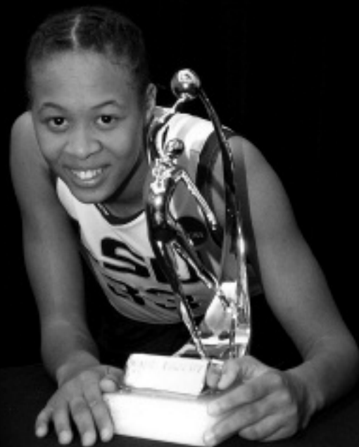
WADE, NAISMITH, AND WOODEN TROPHY WINNER FOR NATIONAL PLAYER OF THE YEAR - SEIMONE AUGUSTUS